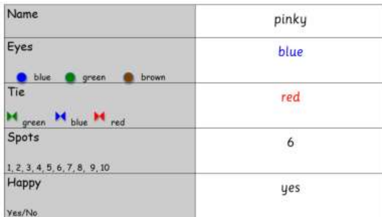
Pet shop database

What similarities can you spot between the pet shop database and the little pig record card below?